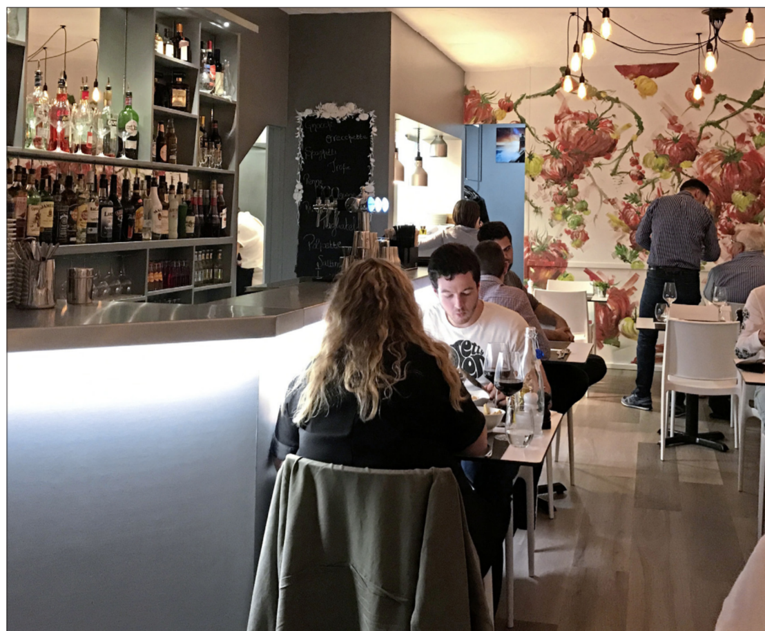
Gusto has been totally transformed by its owners. (19266659)