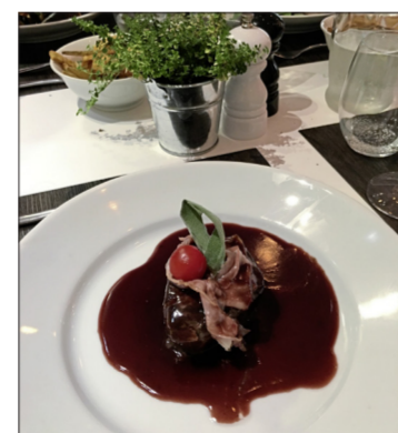
Fillet steak in red wine sauce with crispy pancetta.