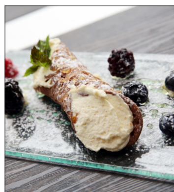
Culinary 'fireworks' - Yvonne's amazing cannolo.