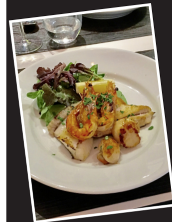
Grigliata del giorno.