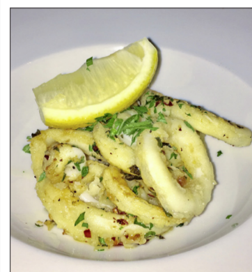
Calamari with chilli and garlic.