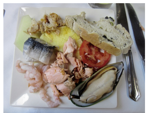
Left and above: A smorgasboard of delights: The chef's market table.