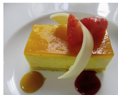
Passion fruit and lemon tart.